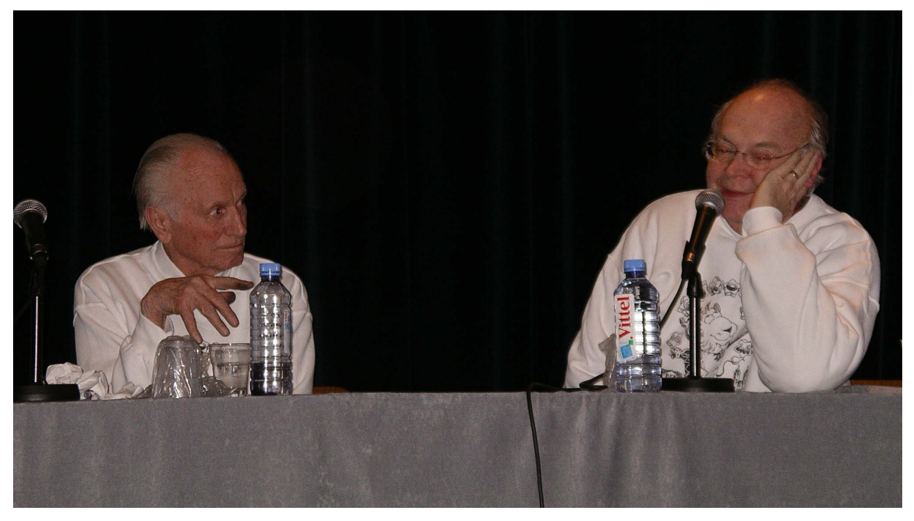
Panel discussion with Hermann Zapf and Donald Knuth: 'With a little help from the wizards' Hermann Zapf, Donald Knuth