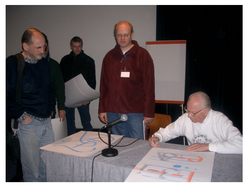
Hermann signing his 'onstage' drawings

The panel ended off with Bogusłav showing a number of the new glyphs in Latin Modern for perusal by Knuth and Zapf. In total the session lasted two full hours, with not a single boring minute in it.