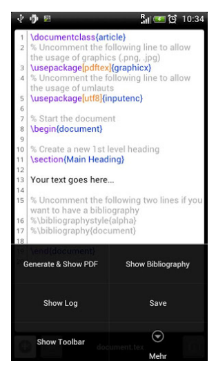
Figure 4: VerbTEX on the Android device