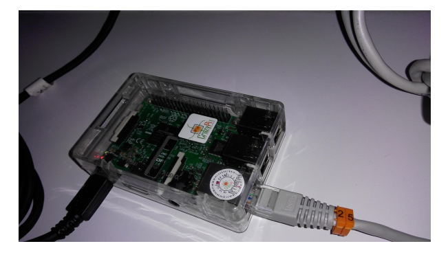
Figure 1: A Raspberry Pi

The idea for implementing this bot arose out of a brainstorming session when the various uses that could be made of the Raspberry Pi were discussed. The question that came up was if it is possible to run T<sub>E</sub>X on the Raspberry Pi. After checking online, it was found that not only could T<sub>E</sub>X be run on the Raspberry Pi, but people were in fact running it [4]. At this point we considered a potential use case for the Raspberry Pi, wherein people could type up a T<sub>E</sub>X file on their mobile phone, send it to server software running on the Pi which could compile the T<sub>E</sub>X file into PostScript or PDF and print it out. The person who had submitted the T<sub>E</sub>X file could then come and collect the typeset and printed output of that T<sub>E</sub>X file. This service could be a paid service.