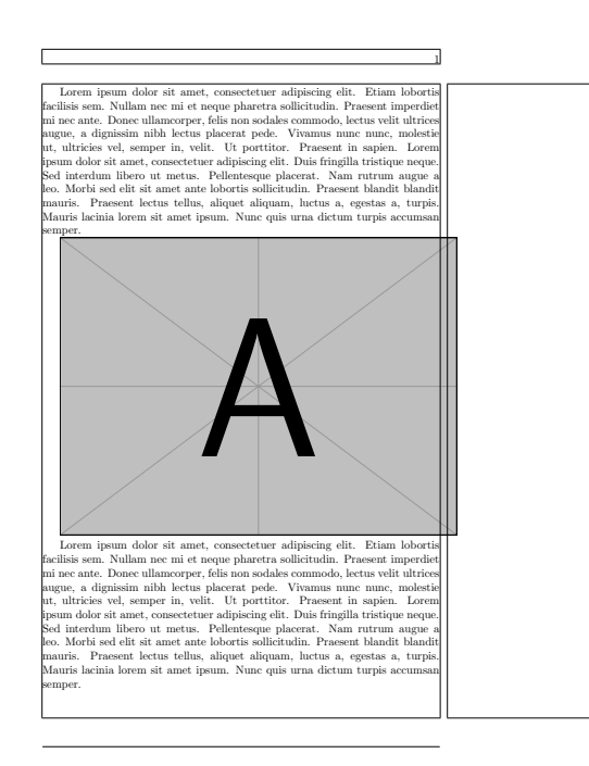
Figure 2: An example of usage of the mwe and showframe packages. The Overfull \hbox is immediately identifiable.