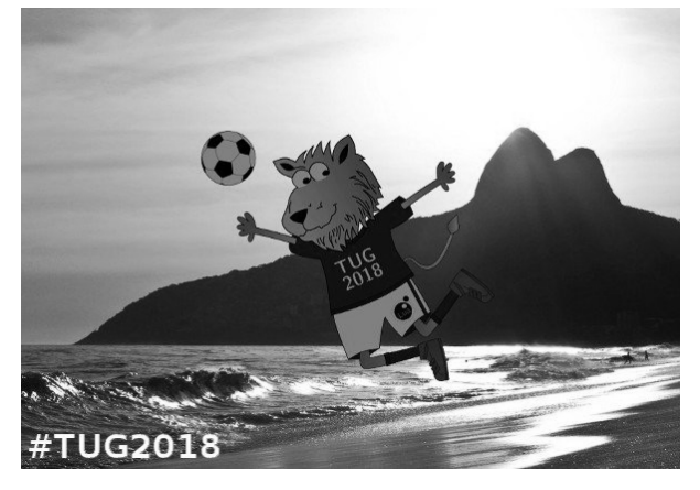
Figure 1: T<sub>E</sub>X Users Group Meeting 2018 in Brazil.

Therefore, prepare your bathing suit (if you have the physique du rôle , you can even dare a thong) and buy a flight to Brazil!